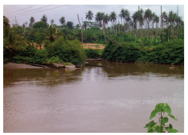
Image 4: Coconut trees over Ankobra river, en route to Teleku Bokazo.

Nzema area was reported to be full of coconut plantations, 15 kilometres deep, accross the entire coast. It was quite so. There was also a coconut-oil processing factory by the road between Esiama and Nkroful.