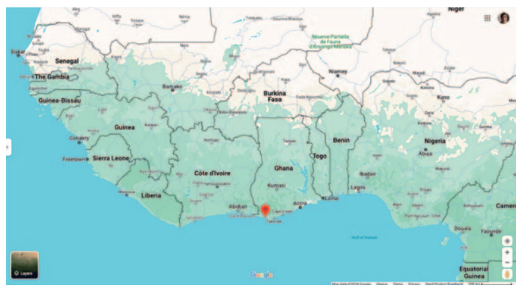
Image 1: Nzema area (spotted with the red-arrow). The area I conducted my research

Ashanti, due to their domination politically before the colonial period and economically during the post-colonial era, had managed to impose their language as the second official after English. There was a Twi-learning course in SOAS (the School of Oriental and African Studies, a few meters away from UCL); I applied, but I was unlucky. They told me that there were limited vacancies and the course was already full. This was my first setback but many others followed.